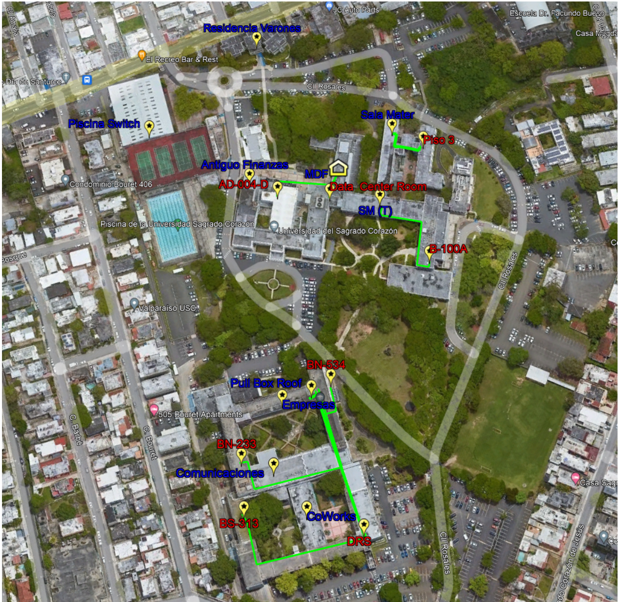
Blue means existing IDF and Location, RED means new requiring installation of Fiber Optic.